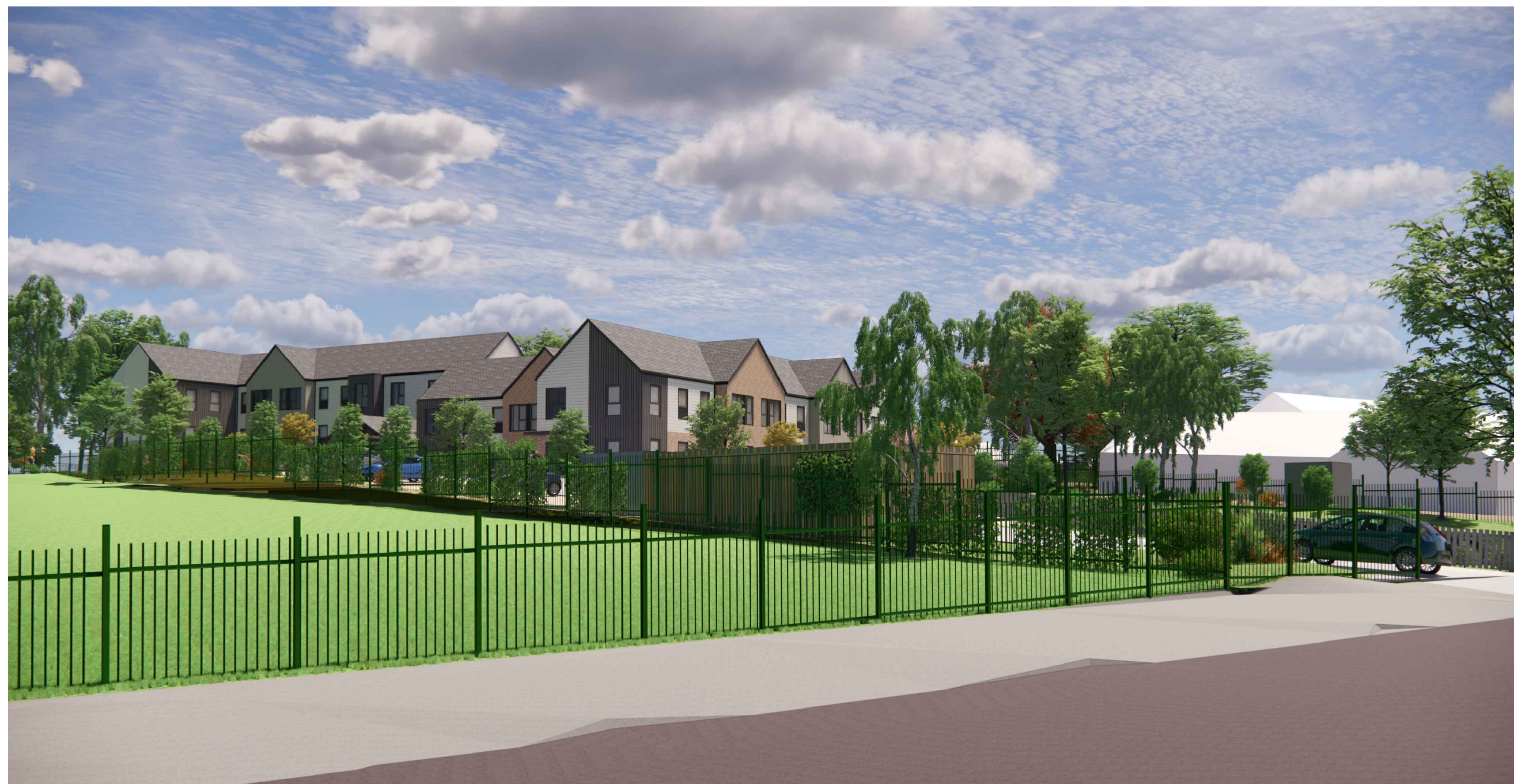
Street View- view through school boundary