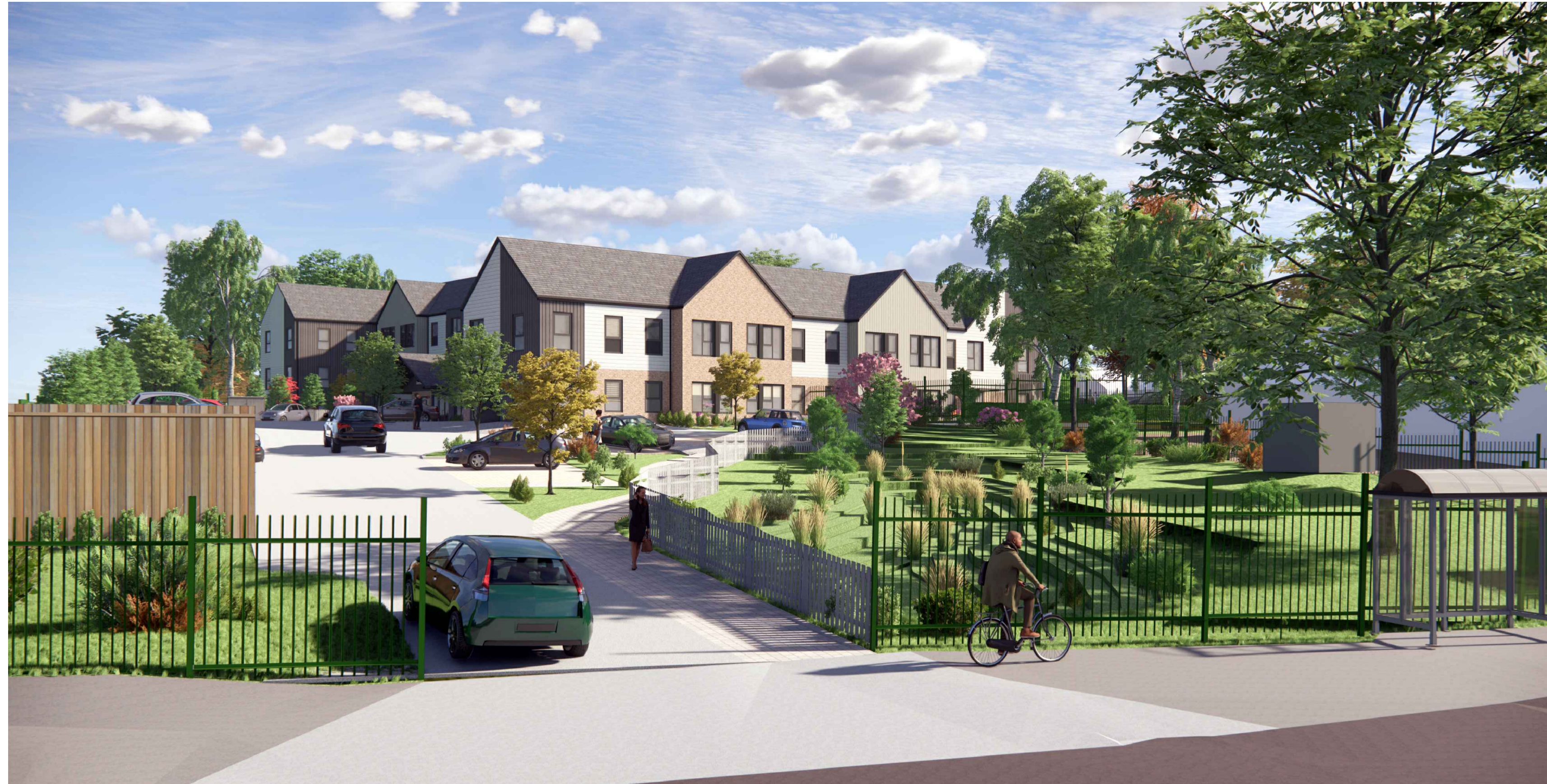
Street view- site entrance